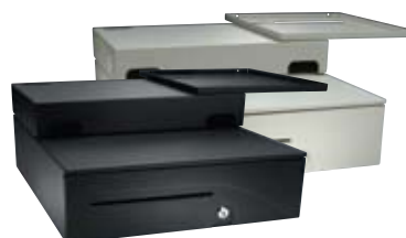
Black / Cloud White

A compact foundation for your POS system, the POS-Integrator provides a solution to the problem of assembling systems on a Series 100 cash drawer. Exploiting the use of a narrow footprint, a riser and printer tray expand the width to accommodate various receipt printers and a full size monitor. Cable management is provided to route and hide peripheral cables.