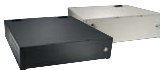
Black / Cloud White

An accessory to the Cash Drawer Caddy System, APG's Caddy Garage takes POS integrated systems to a new level. Now part of the POS component "stack," the PC, along with cabling, fits inside the ventilated Caddy Garage. Removable front and rear latching panels make cable routing easy and hide the PC from view.