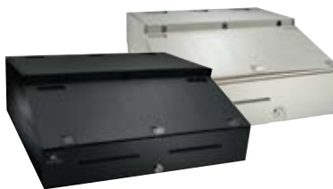
Black / Cloud White

Designed to help bring all the components of a POS workstation together, the Cash Drawer Caddy System includes a heavy duty drawer, a rugged injection molded Base and a sturdy steel Cap. The system allows for peripherals to be placed with left or right-hand orientation and accommodates nearly all major POS keyboard, printer and monitor brands.